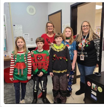
Ugly Sweater Day